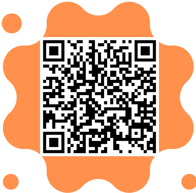
Student Handbook QR

Visit the Student Handbook to learn more about: